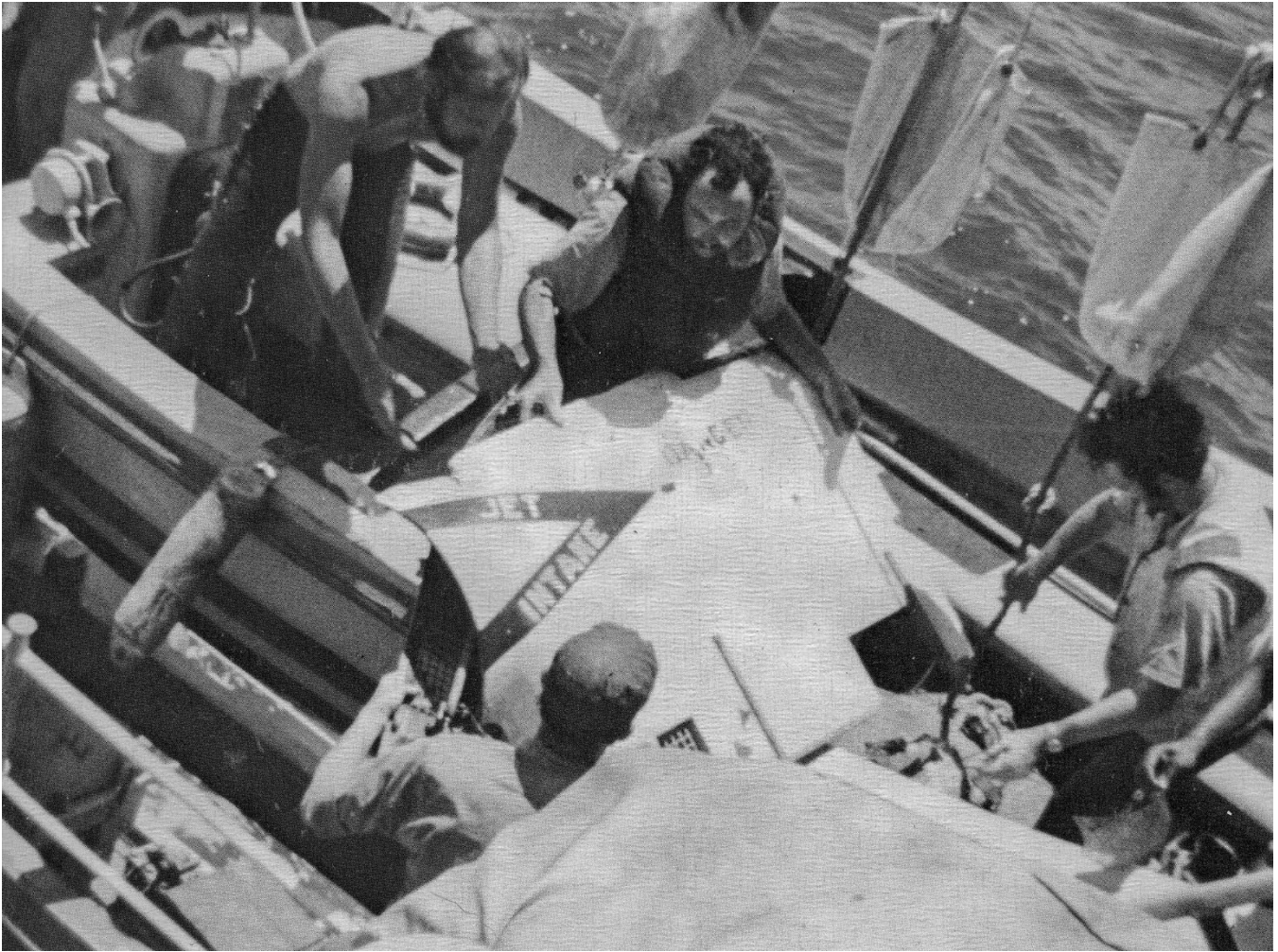
Bradley crew retrieving bits of wreckage from the downed helo

The above deck logs from the USS Ranger (CV 61) were downloaded from National Archives. The link is: